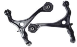
Brand New 2pc Front Control arm for Honda Accord 2.4L 2003 - 2007 Acur...