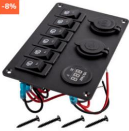
6 Gang Blue LED Rocker Switch Panel Car Truck Auto Marine Boat Circuit Du...