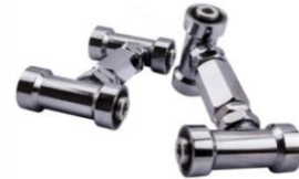
Pair Front Upper Camber Control Arms for Nissan Skyline R32 1989-1992