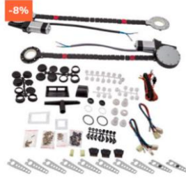
控制臂衬套 Heavy Duty Aluminum Front Control Arm Polyurethane Bushings for...