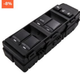
Window Switch Electric Driver Side Front Left Fit for Chrysler Dodge...