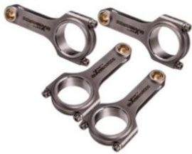
H-Beam Connecting Rods W/ARP Bolts For Audi A3 A4 A6 TT 1.8T for VW Go...