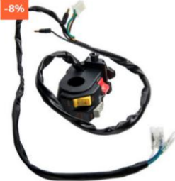
L/H Switch Light Start Kill Switch for Honda FourTrax 300 TRX300...