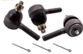
Tie Rod ends Steering Gear Box Drag Link Tie Rod End Fit Club Car DS Golf...