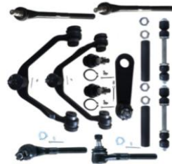
13pc Suspension Kit Control Arm Tie Rod End Sway Bar For Ford 1997-200...