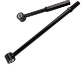
Front Adjustable Track Bar for Ford F250 F350 Excursion 2WD 4WD 99-04