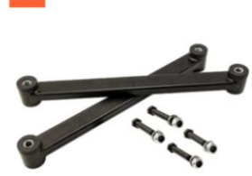
2 Pcs Suspension for Ford Expedition 2002 Rear Lower Trailing Control Arm...