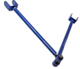
1 Pair For E36 3 Series 318 323 325 328 E46 Rear Lower Camber Control...