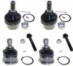
4pc Front Upper and Lower Ball Joints for 2002-2009 GMC Envoy Chevy...