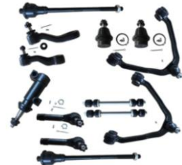
13pcs Complete Control Arm Front Suspension Kit for 02-06 CADILLAC 9...