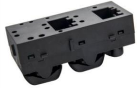
Front Left Master Power Window Door Switch For Ford Crown Victoria 2003-...