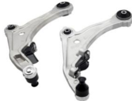
2x Front Lower Control Arms for Nissan Maxima 2009-2014