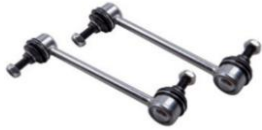
2Pcs Rear Stabilizer Sway Bar End Links Set For Buick Olds Chevrolet Pontiac