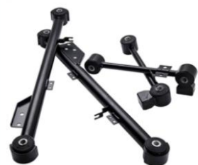
4pcs Rear Upper & Lower Control Arms Kit for Nissan Pathfinder 1997-2004