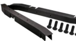
2pcs Center Skid Frame Rust Repair Kit for Jeep Wrangler TJ 1997-2003