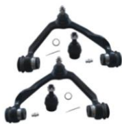
For 1997-2003 Ford F150 F250 Lincoln Navigator 4pcs Front Control Arm+Ball...