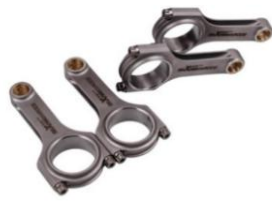
4pcs H-beam Connecting Rods & ARP2000 Bolts for Honda Civic CRX...