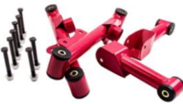
4x Rear Upper and Lower Tubular Control Arm Kits for Ford Mustang...