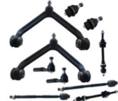
For 2002-2005 Dodge Ram 1500 RWD 10pcs Front Upper Control Arm + Ball...