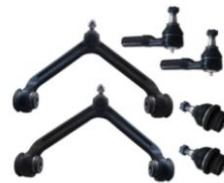
For 02-05 Dodge Ram 1500 6pcs Front Upper Control Arm + Ball Joint + Tie R...