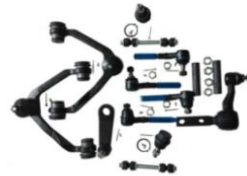
14pcs Complete Control Arm Front Suspension Kit for 97-04 FORD 98-02...