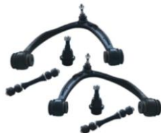
For 07-14 Silverado Tahoe Yukon 4pcs Front Upper Steel Control Arm w/ Ball...