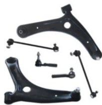
For 07-08 Dodge Caliber 6pcs Front Lower Control Arm+Ball Joint+Sway B...