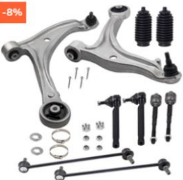
10 Pcs Front Lower Control Arm & Sway Bar for Honda Odyssey 2010 D601008