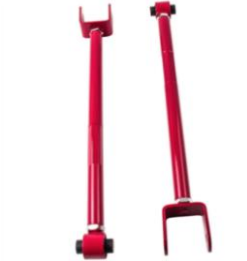
2x Rear Camber Control Arms for BMW E36 E85 E89 Red Color