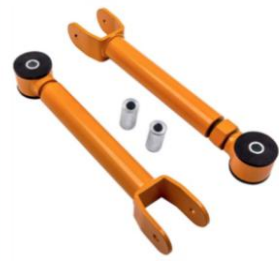
2x Front Upper Complete Adjustable Control Arms For Jeep Wrangler TJ...