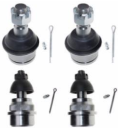
4pcs Front Upper Lower Ball Joints for 90-10 Jeep