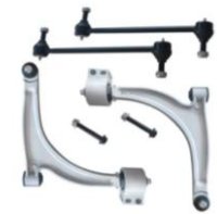
For 2004-09 Aura G6 Malibu 4pcs Front Lower Left+Right Control Arm w/ Ball...