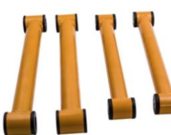
4 Pcs Front Tubular Heavy Duty Carbon Steel Control Arms for Dodge Ram...