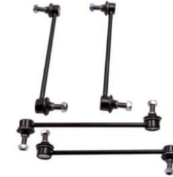
4x Sway Bar Links Kit Front & Rear fit Toyota Camry Avalon/Lexus Es330...