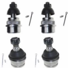
4pcs Ball Joint for Jeep Grand Cherokee Wrangler