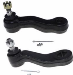
2PCS Pitman Arm Idler Arm Kit For 2003-2006 Cadillac Escalade ESV EXT...