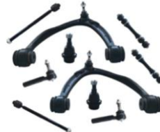
For 2007-2014 Escalade Silverado Yukon 10pcs Front Control Arm w/ Ball...