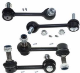
4pcs Stabilizer Sway Bar Links for 2004-2007 Rainer/Trailblazer/Envoy...