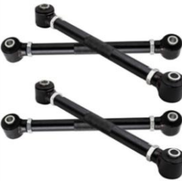
4pcs Rear Camber Control Arms Set for Honda Accord 2003-2007