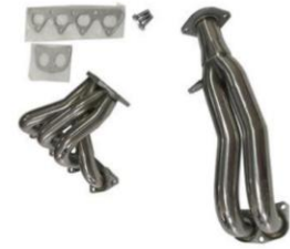
Exhaust Manifold 1.75" / 2" Stainless Steel Header for ACURA INTEGRA 94-...