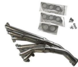
Fits Lexus IS300 01-05 3.0L 2JX-GE Exhaust Manifold Stainless Performanc...