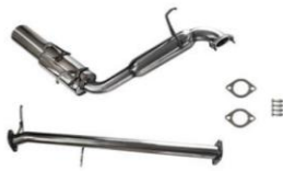
Exhaust Manifold For Mazda Miata MX-5 Eunos 89-97 1.6/1.8L Stainless Catbac...