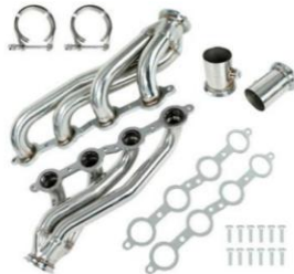
Speed Engineering C-10 LS Chevy GMC Truck Headers LS1 LS2 LS3 (Conversio...