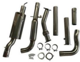
VW GOLF/JETTA MK4 1.8T 3" TIP STAINLESS TURBO CATBACK...