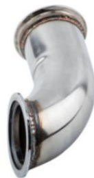
Universal Elbow Adapter Downpipe 90 Degree T304 Stainless 3.0"ID V-band...