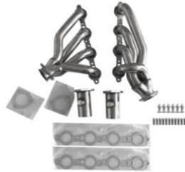
Exhaust Manifold LS S10 Conversion Swap Headers For LS1, LS2, LS3, LS6...