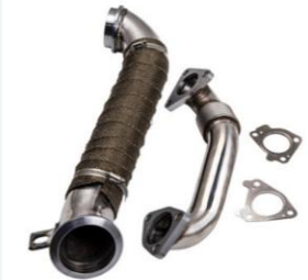
3 inch Turbo Down Pipe & Up-pipe for CHEVY GMC DURAMAX DIESEL 6.6L...