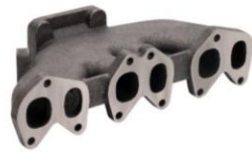
T3 T4 Hybrid Turbos Exhaust Manifold For Volkswagen Golf / VR6 / Corrado...