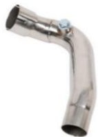
Eliminator Race Exhaust Mid Pipe For Honda 2007-18 CBR600RR CBR600