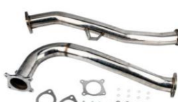
3" Manual Downpipe Exhaust J Pipe T304 Steel for Subaru Impreza WRX...