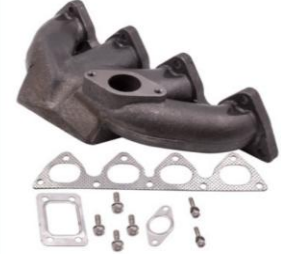
Cast Iron T3/T4 Turbo Exhaust Manifold For Honda Civic 1988-2000 B16 B18...