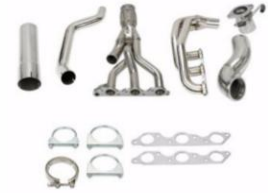
3.8L V6 Supercharged Exhaust Manifold Headers Downpipe