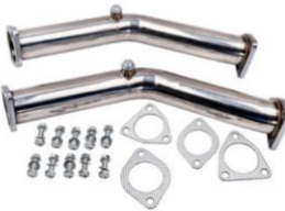
2 Test Pipes Decat Non Reson Straight Exhaust Fit Nissan 350Z Infiniti G35...