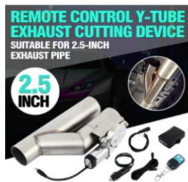
2.5" 63mm Electric Exhaust Downpipe Cutout E-Cut Out Dual Valve W/ Remote