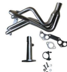
Exhaust Manifold Performance Header FITS Mazda B2000 B2200 86-93 2.0L...