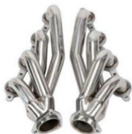
Fits Chevy LS1 LS2 LS3 LS6 LS7 Stainless Steel Exhaust Headers...