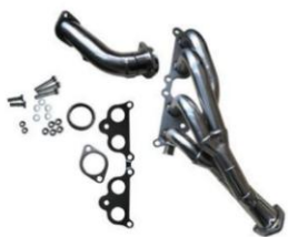
For Toyota Tacoma 95-01 2.4L 2.7L L4 Tri-Y Exhaust Manifold Performance...