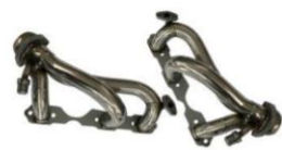
STAINLESS STEEL HEADER EXHAUST MANIFOLD For 96-01 CHEVY...