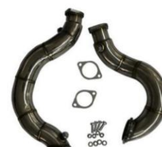
3" Stainless Downpipes FITS BMW N54 E90/E91/E92/E93/E82/135i/335i Twin...