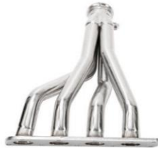
FOR 05-07 CHEVY COBALT SS/ION STAINLESS RACING HEADER...