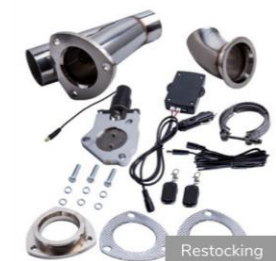
Remote Electric Exhaust Catback Downpipe Cutout E-Cut Out Valve...