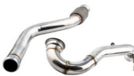
3" - 3.5" Catless Exhaust Downpipe for Mercedes Benz A45/GLA45 AMG 201...