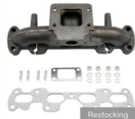
T3/T4 Turbo Exhaust Manifold Cast Iron Exhaust Header For Mazda Miata MX-...