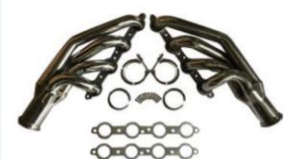
TURBO MANIFOLD EXHAUST HEADER FOR 97-14 CHEVY SMALL BLOCK V8...