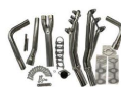
Performance Exhaust Manifold Headers For Toyota 4Runner Pickup 3.0L V6...