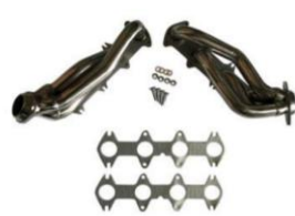
For Ford F150 04-10 5.4L V8 Performance Stainless Exhaust Manifold...