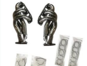
FOR 03-07 350Z G35 COUPE VQ35DE 6-2 RACING/PERFORMANCE...