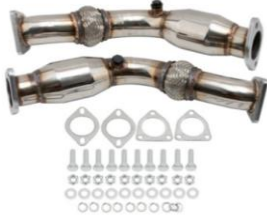
Exhaust Downpipe Pipes for Infiniti G35 350Z for Nissan 350Z VQ35DE 2003-...