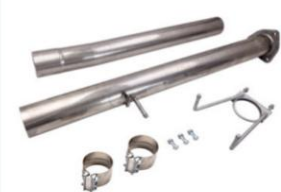
2 Straight Exhaust Tube Pipe 2013-2017 Fit Dodge Ram 2500 3500 6.7L...