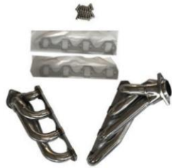
Exhaust Manifold 1.25" / 2.25" Header for Ford Mustang 79-93 5.0L V8...