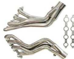
Stainless Steel Headers LS Swap For Camaro Firebird 82-92 Third Gen F...