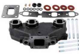
Exhaust Dry Joint Manifold Replaces For Mercruiser For GM 4.3L V6 2002-...