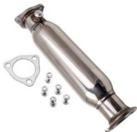
1pcs Exhaust Test Piping Pipe for Honda Civic 1988 1989 1990-2000 T304...