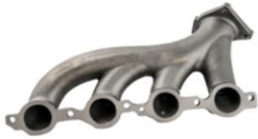
Exhaust Turbo Manifold for GMC Sierra for Chevy Silverado 4.8 5.3 5.7 6.0 6.2...