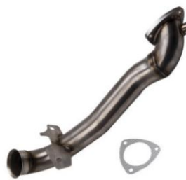
2.5 inch Turbo Catless Downpipe for Mini Cooper S Clubman 2008-2014...