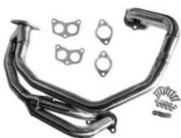
FOR 97-05 SUBARU IMPREZA 2.5 RS EJ25 NA STAINLESS RACING HEADE...