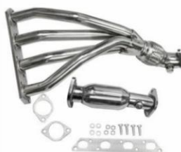
Fits Mini Cooper 02-06 R53 1.6L Base & S Stainless Race Manifold Header & Pipe