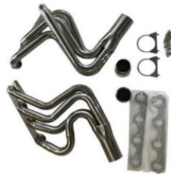
Fit 87-96 Ford F150 F250 Bronco Pickup 5.8L V8 Racing Ss Manifold...