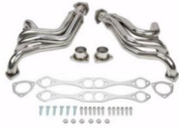
For 1955-1957 Small Block Chevy Car 150 210 Bel Air Chassis Headers...