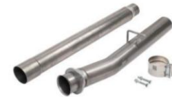
Diesel Truck Muffler Delete Pipe Eliminator DPF For Ford Super Duty 08...