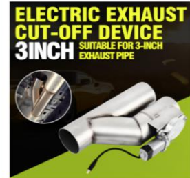
3" Electric Exhaust Cutout Remote Controller Motor E-cut Valve Kit Dual...