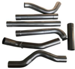
4" Turbo Back Exhaust & Down Pipe 03-07 Ford F250 F350 6.0L Diesel Pickup...