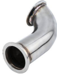
Universal Elbow Adapter Downpipe 90 Degree T304 Stainless 2.5"ID V-band...