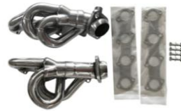
Shorty Exhaust Header Manifold for 97-03 Ford F150/F250/Expedition 4.6 281...