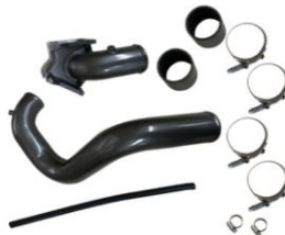
Diesel GRAY Intercooler Pipe&Y-Bridge Kit for 2006-2010 GM 6.6L