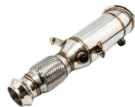
Catless Downpipe For BMW N26 320i 328i 420i 428i 428ix F20 F30 2.0L 2.0...