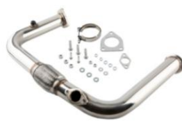
Stainless Steel Pipe T4 Turbo Manifold for Chevy Silverado for GMC Sierra 4.8...