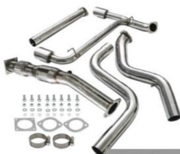
Dual Muffler Tip Exhaust Catback System + Downpipe for Neio SRT4 2.4...