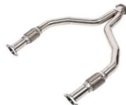
FOR 370Z Z34/G37 V36 VQ37VHR 08-16 STAINLESS RACING XY...