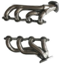
SS MANIFOLD SHORTY HEADER/EXHAUST FOR CHEVY...